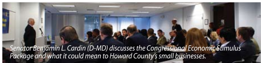
Senator Benjamin L. Cardin (D-MD) discusses the Congressional Economic Stimulus Package and what it could mean to Howard County's small businesses.

The town hall meeting was facilitated by the Howard County Chamber of Commerce and the Howard County Economic Development Authority. 🌐