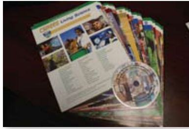
The Youth in Agriculture Career Development Program's educator resource kit includes profiles for the many careers which require specialized agricultural knowledge and a CD containing the accompanying audiovisual presentation.

The Youth in Agriculture Career Development Program—a collaborative effort between the Howard County Economic Development Authority's Agricultural Marketing Program and the Maryland Cooperative Extension -